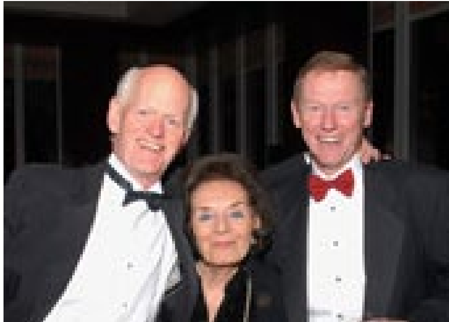
Marshall Goldsmith, Frances Hesselbein, Alan Mulally